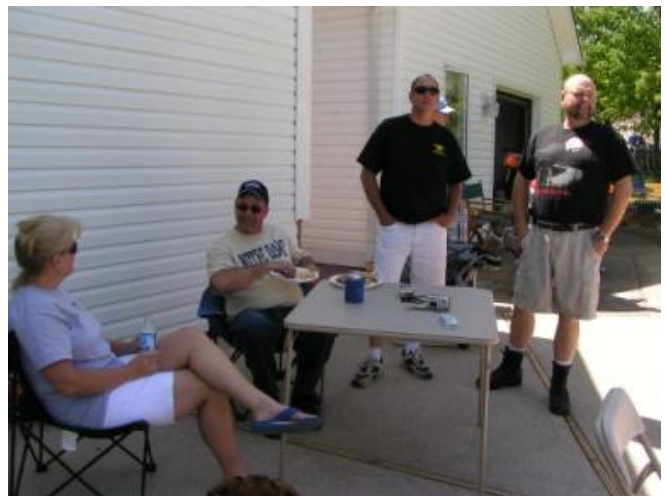
I can't eat any more...