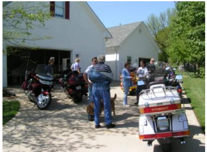
I guess we're going to have to work on 'em now...