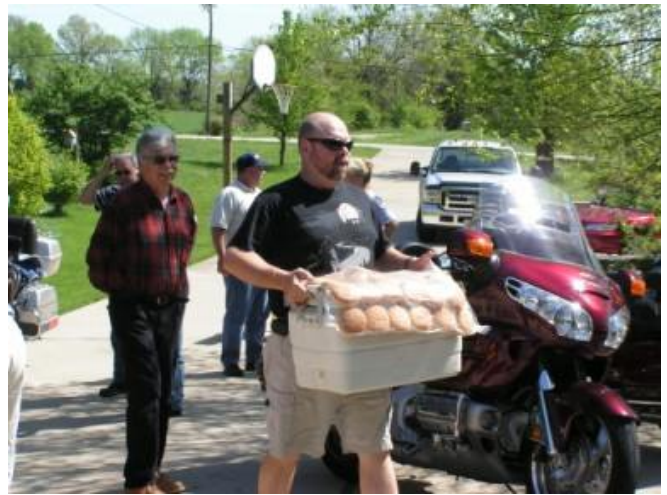
Bring on the food...