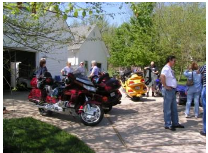
There was ample room for multiple people to work on bikes.

We had a good turnout and plenty of help on hand for advice on bike maintenance and tool sharing.