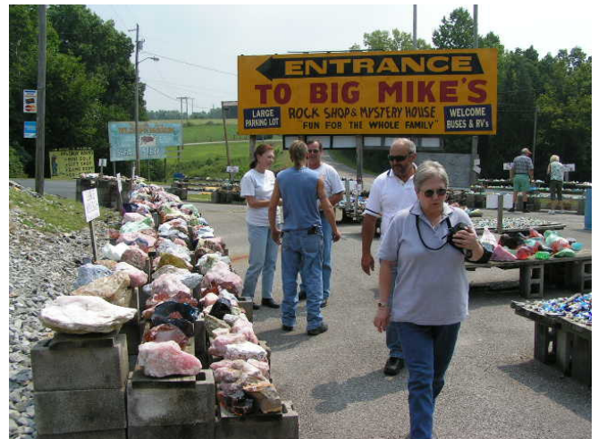
Kentucky's biggest Rock Shop...