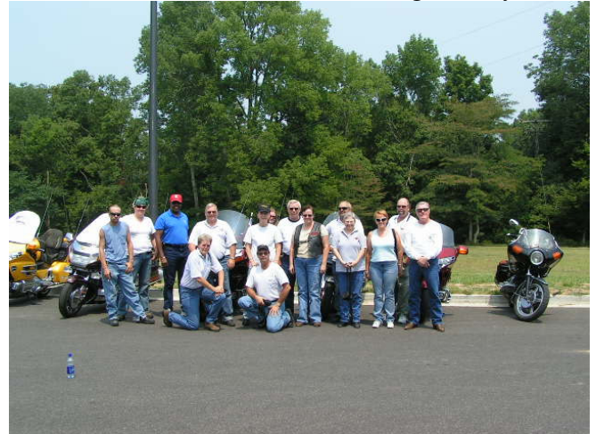
We had a good turnout for the Mammoth Cave Ride.

Haven for ice cream, really good ice cream... got back into Louisville about 7 PM, a great days ride.