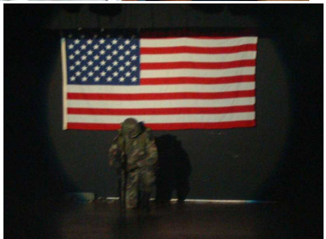
GREAT CLOSING CEREMONY!