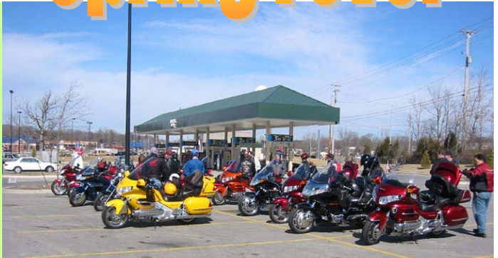
What a beautiful day and what a beautiful sight!