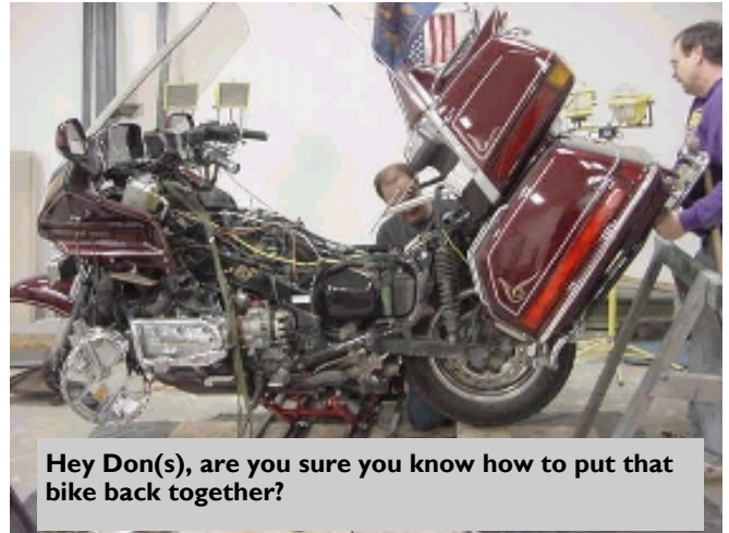
Hey Don(s), are you sure you know how to put that bike back together?