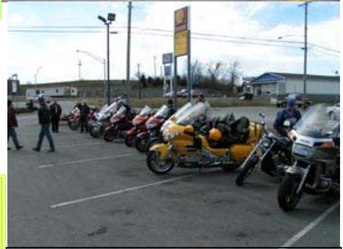
On April 29th, the members of the chapter (along with a few new friends) responded to a few phone calls. WOW—we had sixteen bikes on a ride down to Springfield, over to Bardstown and back to Louisville. I'm sure this was the result of Spring Fever .